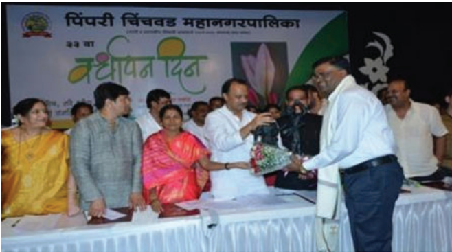
Exponential was awarded for Best Industry in PCMC presented by Ajit Pawar