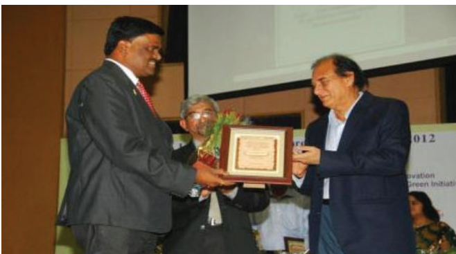
Exponential was awarded for Late B.G.Deshmukh CSR award in 2012 by MCCIA